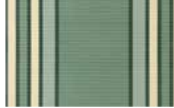
625 PALM BEACH